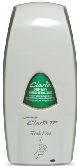
91866-00 6/case - White Foam Only