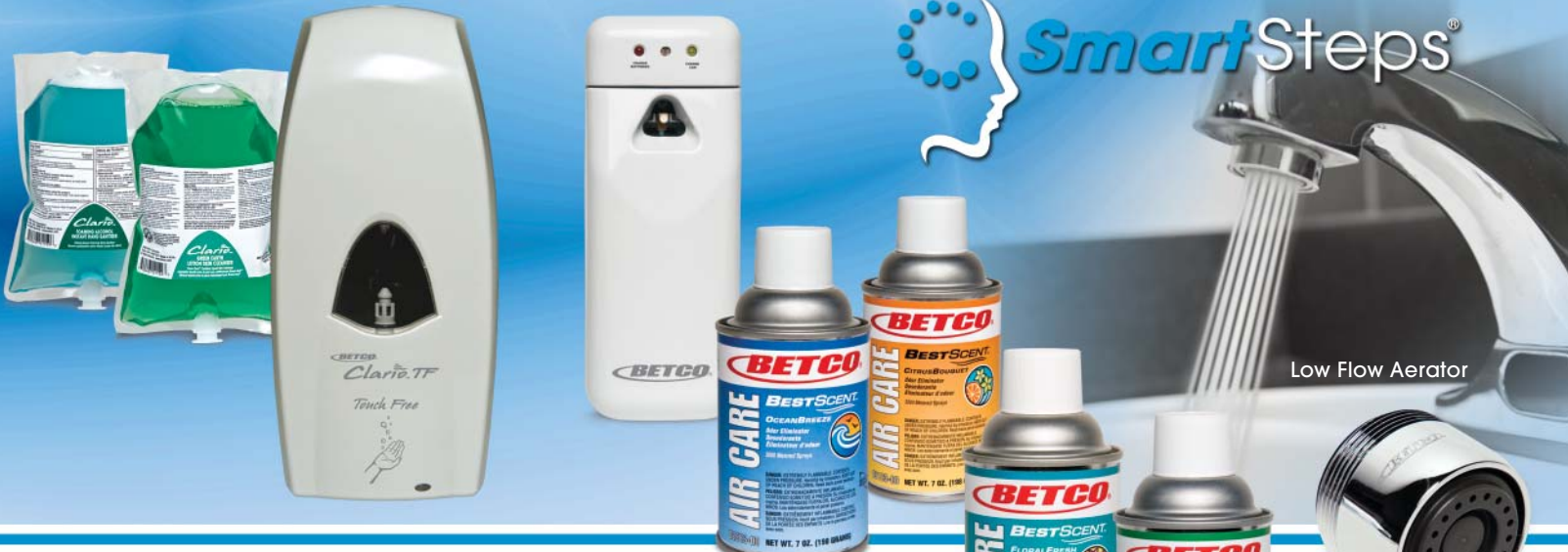
Low Flow Aerator